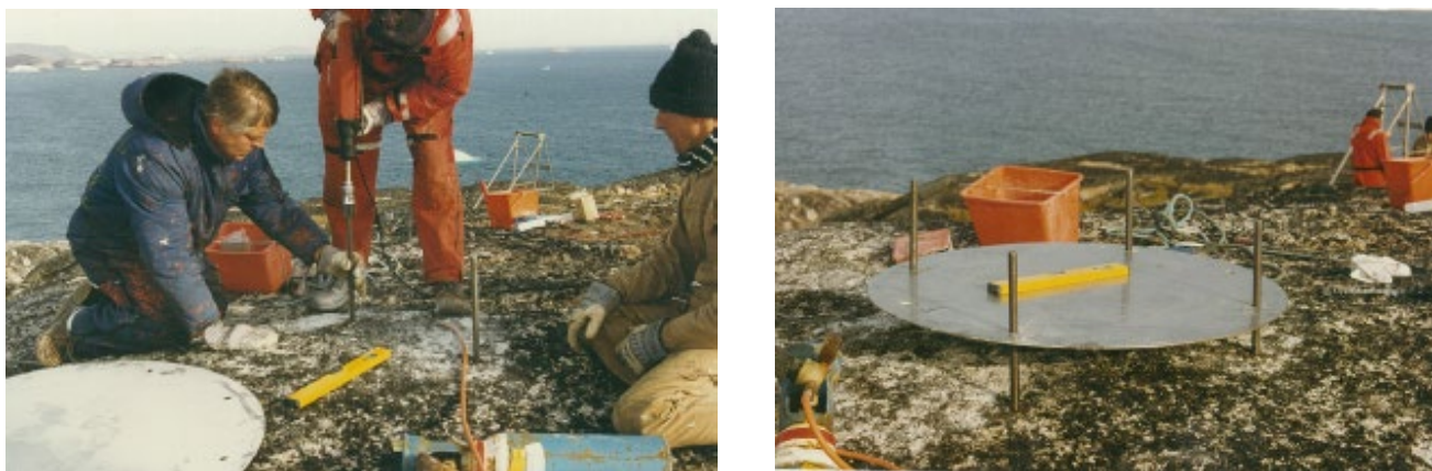
Figure 3 Examples of a simple foundation which is preferred in Polar Regions to ensure a swift installation and to reduce the use of heavy equipment and large quantities of materials.

Refer to http://www.pws.gov.nt.ca/pdf/publications/GeotechnicalGuidelines.pdf for more information on Soil Investigation in Permafrost.