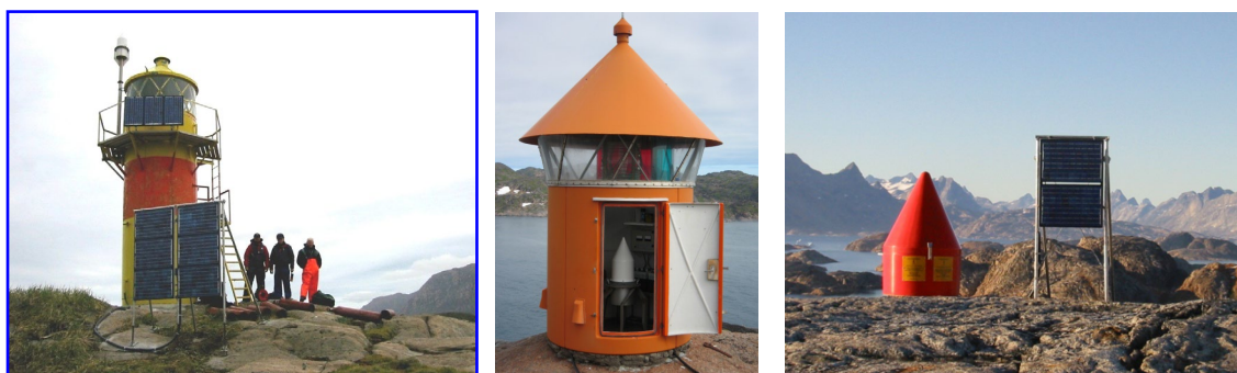
Figure 4 Examples of housings in Greenland