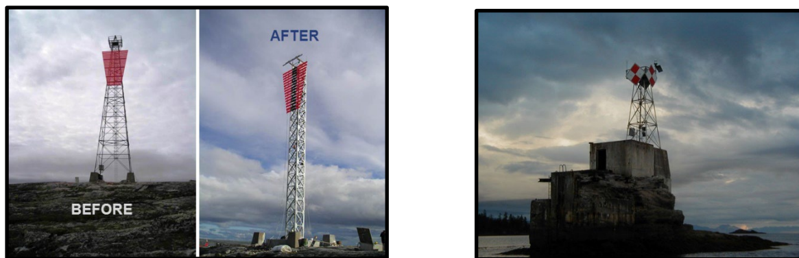
Figure 5 Examples of structures suitable for Polar Regions (Koksoak River in Canada, Lincoln Island in Alaska)

could/should be considered, such as local contracts to verify the equipment on a regular interval. Further information on outsourcing is provided in maintenance section 7.1.4.