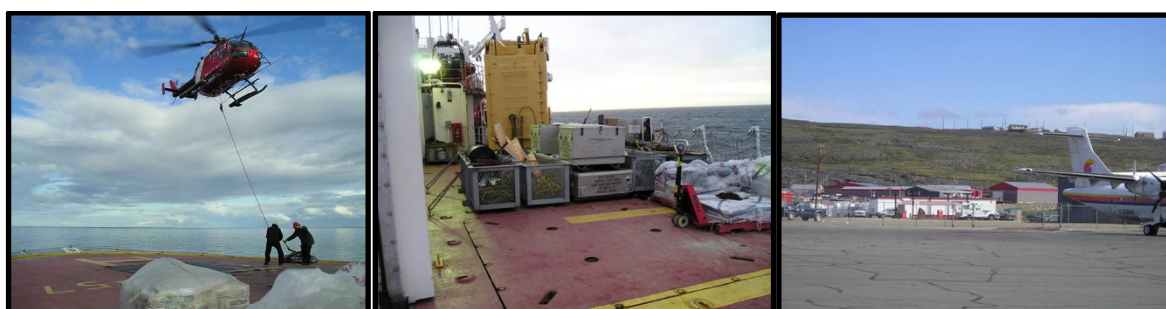
Figure 8 Methods of transportation to Polar Regions

The remoteness of Polar Regions requires more planning than other areas. Construction crews should ensure they understand the issues they may encounter. Typical non-polar sites may be accessed by road, small boat or helicopter with contractors readily available and material and equipment easily sourced locally. In Polar Regions, options are rather limited and in many locations only seasonal access is possible. Many areas can have access restrictions due to local environmental protection regulations such as species at risk, among other challenges.