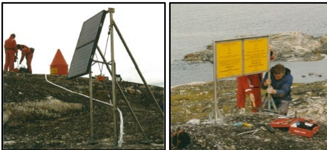
Figure 7 Example of cable protection against wild animals & notices to deter vandalism