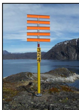
Figure 6 Simple land based unlit structure

For locations where a solution is not achievable with equipment presently available, industry engagement may be required.