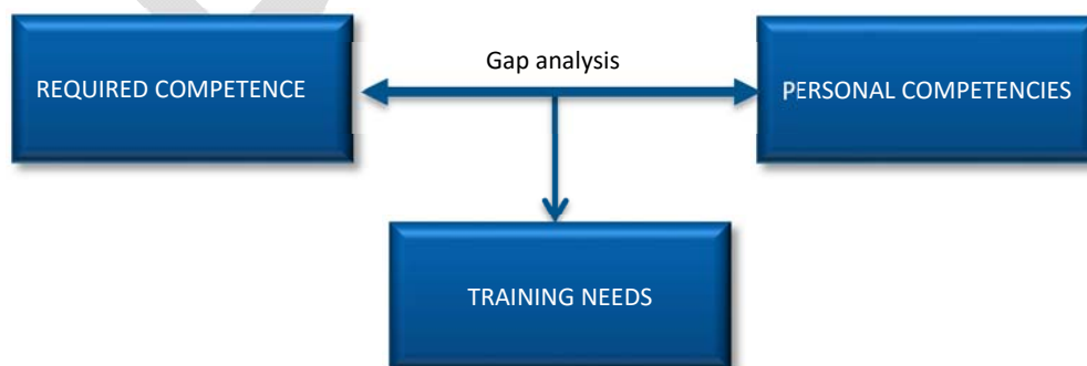
Figure 2 Training needs analysis

The training needs analysis, as described in IALA Guideline 1103 (on Train the Trainer), is an assessment conducted by the VTS Authority to identify a gap between the minimum acceptable standard of performance, as described in IALA Recommendation V-103 and its associated Model Courses, and the actual performance of the VTSO.