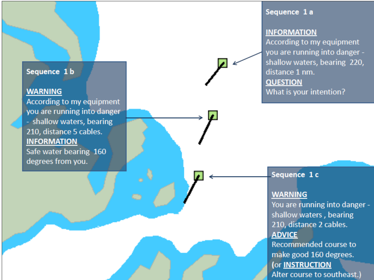
Figure 3 Example of VHF communication between VTS and ship during NAVIGATIONAL ASSISTANCE SERVICE

The picture shows three sequences where a situation is building up. Finally the situation becomes time critical and the communication will be urgent. However, the VTS operator should have the full authority to give an INSTRUCTION.